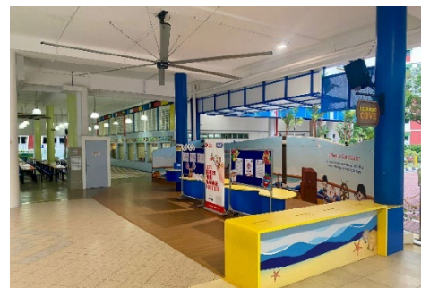
Figure 11 – HVLS Fan at Learning Cove

19. Providing a Conducive Learning Environment . As part of our continual efforts to enhance the school environment, we have completed the installation of a High-Volume Low Speed (HVLS) fan at the Learning Cove during the Term 3 school holidays (see Figure 11 ). This improvement enhances air circulation and ventilation in this popular space where students gather for recess activities, independent reading, and other learning engagements, creating a more comfortable environment that supports better focus and engagement.