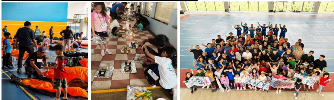
Figure 10 – Dad's for Life Camp (30 to 31 August)

17. Dad's For Life Camp . Our father-child pairs bonded wonderfully during the two-day camp from 30 to 31 August through activities such as cooking, tent pitching and telematch games (see Figure 10 ). The successful conclusion of the camp was made possible through the dedicated support of our student leaders, enthusiastic parent volunteers from PSG, and colleagues from the Partnership Committee. We eagerly anticipate another wonderful collaboration for the next camp in early 2026!