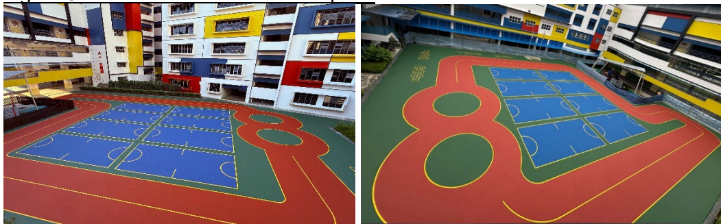
Figure 3 – A More Vibrant Parade Square

8. Library Fiesta 2025. We hope that the Library Fiesta 2025 has promoted reading and broadened students' exposure to popular stories and characters, thereby strengthening their appreciation of literature both in and beyond the classroom. Through engaging experiences such as the Readers' Theatre, student book talks, character dress-up, and interactive recess and classroom activities, students were immersed in the world of stories and characters (see Figure 4 ). These activities not only created a joyful and vibrant atmosphere around books, but also encouraged students to explore new genres, express their creativity, and share their reflections with their peers.