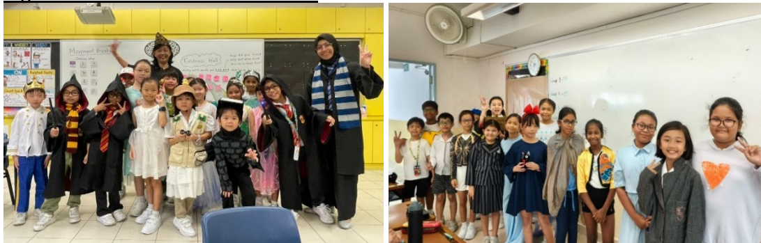
Figure 4 – Characters Come Alive!

8. Library Fiesta 2025. We hope that the Library Fiesta 2025 has promoted reading and broadened students' exposure to popular stories and characters, thereby strengthening their appreciation of literature both in and beyond the classroom. Through engaging experiences such as the Readers' Theatre, student book talks, character dress-up, and interactive recess and classroom activities, students were immersed in the world of stories and characters (see Figure 4 ). These activities not only created a joyful and vibrant atmosphere around books, but also encouraged students to explore new genres, express their creativity, and share their reflections with their peers.