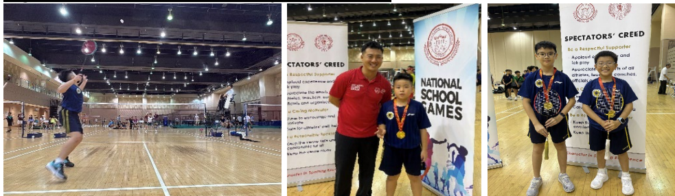
Figure 9 – Our Badminton Players in Action

17. Dad's For Life Camp . Our father-child pairs bonded wonderfully during the two-day camp from 30 to 31 August through activities such as cooking, tent pitching and telematch games (see Figure 10 ). The successful conclusion of the camp was made possible through the dedicated support of our student leaders, enthusiastic parent volunteers from PSG, and colleagues from the Partnership Committee. We eagerly anticipate another wonderful collaboration for the next camp in early 2026!