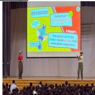
Sharing on food sustainability during assembly programme