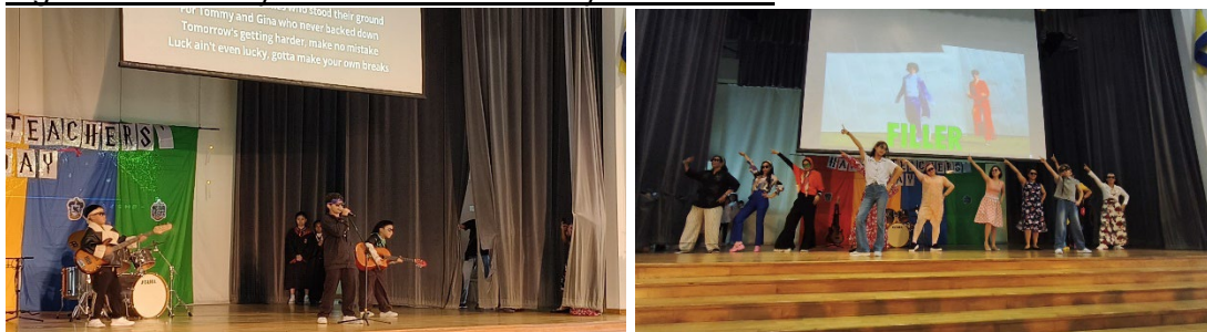
Figure 7 – Primary School Teachers' Day Celebration

14. Over at MK@Sembawang, the PSG made the theme "Favourite Childhood Characters" extra special by featuring photographs of teachers in their younger days, allowing students to match them with their present-day selves. The celebration also included student videos, a "guess the student voice" contest, and well wishes from alumni (see Figure 8 ).