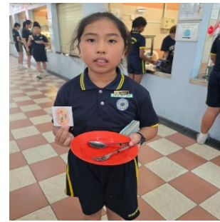
A student proudly showing her clean plate!

10. Academic Support Programme for Selected P6 Students. We continued to provide support to selected P6 students in the lead-up to the PSLE, including face-to-face revision lessons in the school during the pre-PSLE study break from 22 to 24 September. Our P6 teachers maintained open communication platforms to assist students who sought clarifications and had doubts during their home revision. All the best to our graduating cohort!