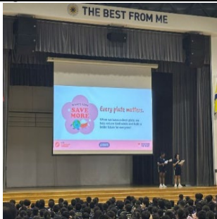
Green Leaders' sharing during Positive Minutes