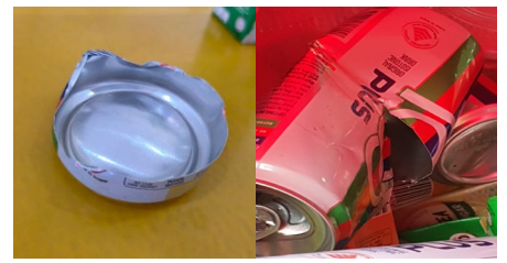
Figure 1 – Safety hazards presented by severed cans

8. Canteen Safety. We have implemented safety measures in the canteen, including anti-slip mats/strips and ensuring vendors follow HPB guidelines for food preparation and packaging. However, we have received reports of safety concerns regarding canned drinks being severed or crushed (see Figure 1 ). To address this issue, we will discontinue the sale of canned drinks in the school canteen once the current stock is depleted. In the meantime, teachers and staff on canteen duty have been instructed to monitor students who purchase canned drinks.