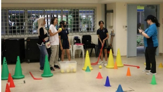
Figure 4 – One of the many Lower Primary game stations

Lower Primary students enjoyed a variety of carnival games run by our dedicated Parent Support Group (PSG) members and enthusiastic student helpers (Figure 4). P3 and P4 students channelled their energy into learning street tennis, guided by coaches from SportSG. Our P5 and P6 students demonstrated resilience as they overcame the Mini Spartan Challenge, spurred on by the encouraging cheers of their peers and teachers.