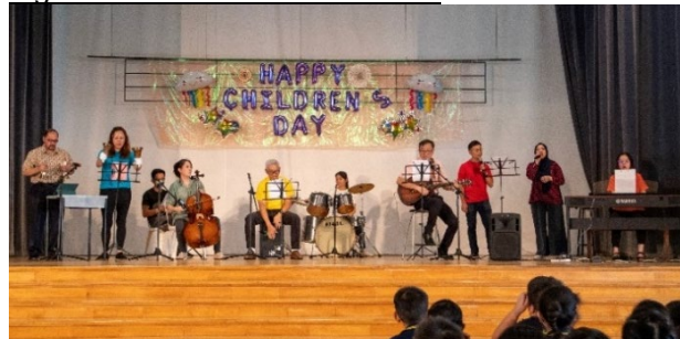
Figure 5 – The “Perfect 10” Band

12. Students also embraced the spirit of giving, fostering essential values of care, compassion and empathy through the Children's Day Appeal (CDA) donation drive organised by Community Chest. The fundraising efforts, advocating for children's involvement, also encouraged parents to join their child in contributing to communities in need.