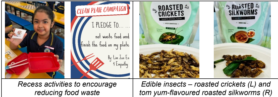
Figure 3 – Clean Plate Campaign

11. Children’s Day Celebration. Our school community embraced the kampung spirit to create a memorable celebration for our students. This special day exemplified the power of collaboration and community engagement, bringing together students, staff, and parents in a joyful celebration of childhood and learning.