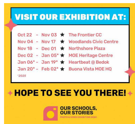
Figure 2 – OSOS Exhibition Details