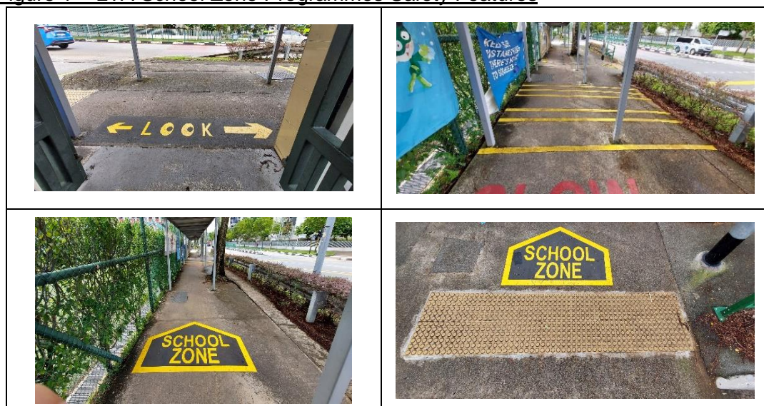
Figure 1 – LTA School Zone Programmes Safety Features