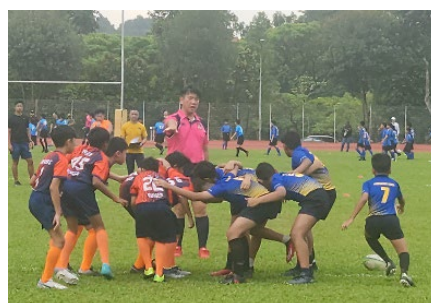
Figure 2 – Our rugby boys in action

9. National School Games (NSG) . Our track & field team and rugby boys have done it again! The track & field team has clinched a combined total of 29 medals (5 gold, 2 silver and 22 bronze) in the Senior and Junior Division competitions. Our stallions in the rugby team fought and "scrumped" their way to be crowned the champions in the Tier 2 NSG Rugby Competition (see Figure 2 ). As the saying goes, "success is a journey, not a destination". We are certain that our track & field athletes and rugby boys were inspired, motivated and focused on each step along the way towards achieving success!