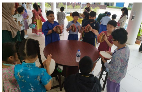
Figure 3 – Student trying out the Kompang

11. P5 National Education (NE) Show . 219 students, accompanied by 15 teachers, attended the NE Show held at the Padang on 2 July. This year's National Day theme is Onward As One . Our P5 students had a memorable experience, and clearly enjoyed every moment of the show! See Figure 4 .