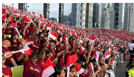
Figure 4 – NE Show

12. e-Open House . The e-Open House was successfully conducted on 22 July. It was an engaging session where the panel members answered the queries raised by parents whose children are attending P1 in 2024. Till date, the live stream had clocked a total of more than 900 views on the school's social media channels (Facebook and YouTube). You may revisit the live stream via https://go.gov.sg/2023sbpseopenhouse .