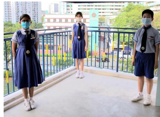
The 3 Head Prefect candidates