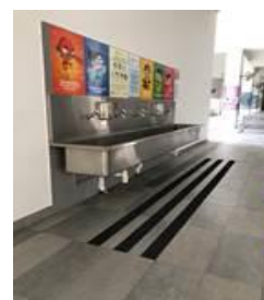
Figure 1 – Anti-Slip Strips

9. Road Safety. The school cares for the safety of your child. Staff on duty at the traffic light crossings in front of the school main gate have been briefed to monitor students using the crossings, and to remind our students on the proper conduct at these traffic crossings. Hence, we seek your support to educate your child to practise the Kerb Drills when crossing the road – “ look right, look left, look right again; ensure all vehicles have stopped; raise your right hand high up and cross the road briskly ”.