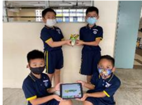
Students learning about Financial Literacy