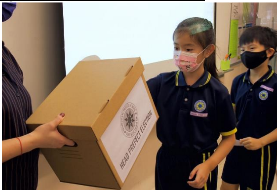
Students casting their votes in the classrooms