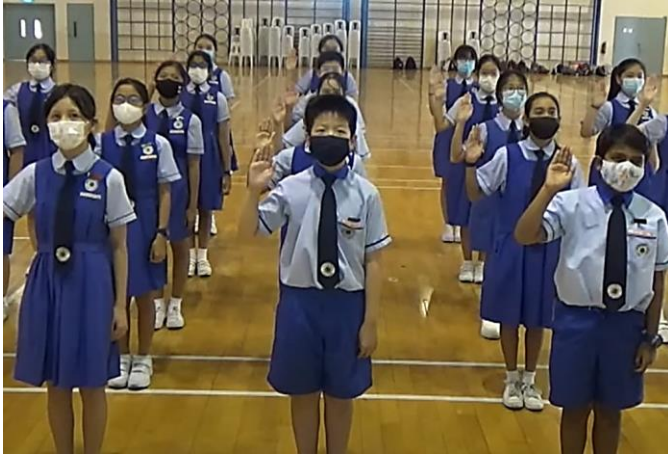
Figure 4 – Recital of the Prefects' Pledge led by the elected Head Prefect